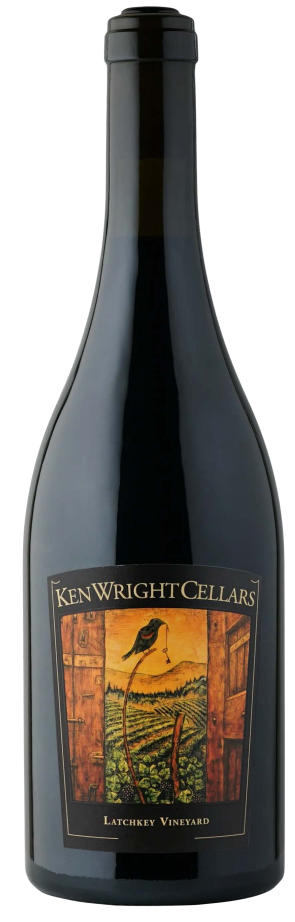
Artwork shows Latchkey vineyard through our winery's 200 year old doors.