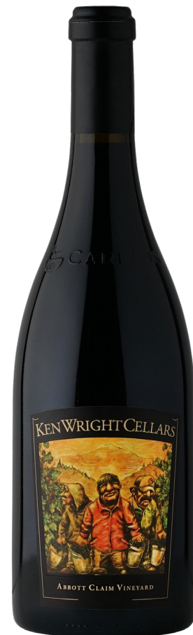
Artwork depicting harvest.