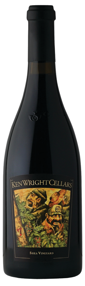
Artwork shows the practice of shoot positioning.