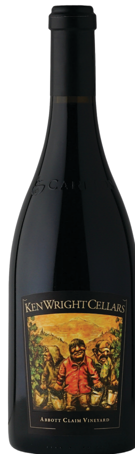
Artwork depicting harvest.